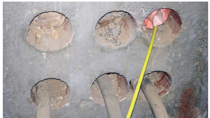
Inside of building introduction of various cables as well as unoccupied openings

The requirement is to seal medium-voltage cables and control cables in electricity substations from the external transformer (33 kV/11 kV) to the switchgears inside the building and cable basement subsequently. The cables - partly laid in oval wall sleeves - have to be sealed to prevent the ingress of animals, sand, water and gas. The challenge is to develop a cable seal, which is adjustable to the outside diameters of the cables and to the deformed oval wall sleeves. The cable diameters vary from Ø 14 up to 108 mm, and the wall sleeves from Ø 145 up to 165 mm. The use of segmented ring technology provides the answer to all these challenges and also allows the provision of reserve openings for additional cables to be laid in the future. Since not all openings are occupied with cables, an easy process for retrofit and later laying of cables is also required.