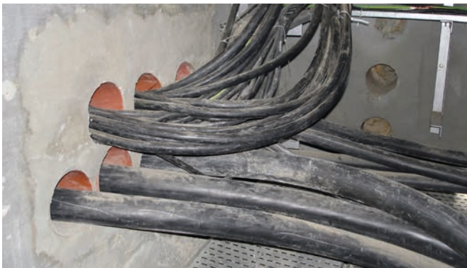
Inside of building several cables of different diameters are laid into the building