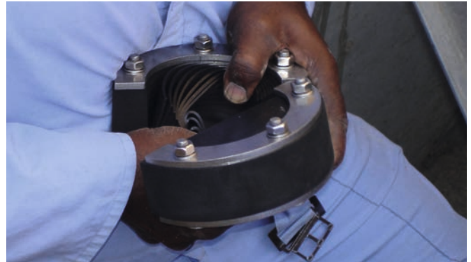
Segmented ring technology the split design allows effortless removal of the individual segmented rings

The universal press seal is ideal for use in core drillings or wall sleeves for sealing medium and low-voltage cables. The split design allows effortless installation – even on cables that are already in place. Integrated blank seals keep reserve openings sealed, ready for later laying of additional cables. Segmented ring technology allows any cable seal to be adapted to the individual cable diameter in seconds. All what is needed is to easily remove the segmented rings, place the seal around the cable, insert the cable seal in the wall sleeve and tighten the screws with the torque meter!